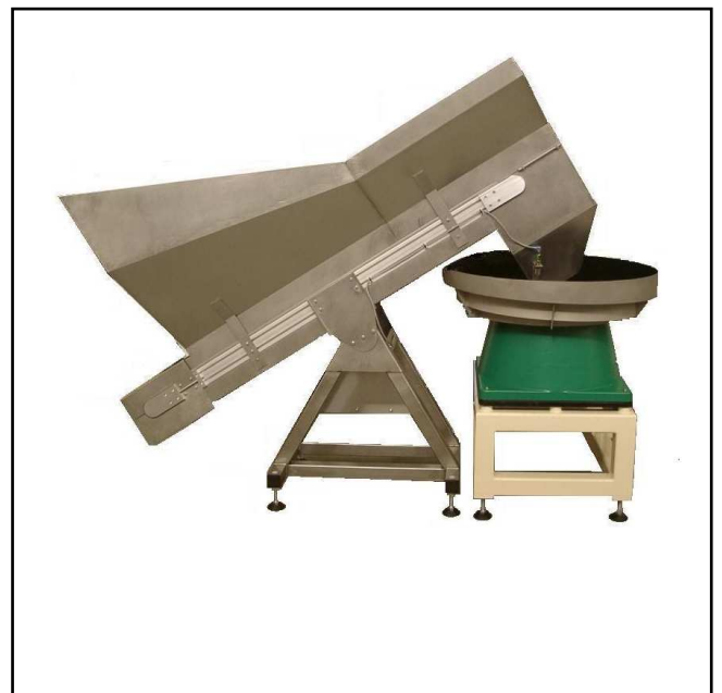
Figure 2 : AAE bulkfeeder in combination with an AAE vibration feeder